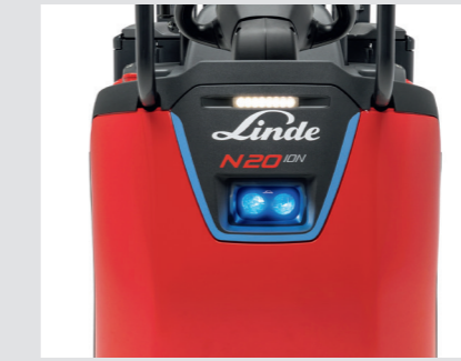
Linde BlueSpot™ and front LED light