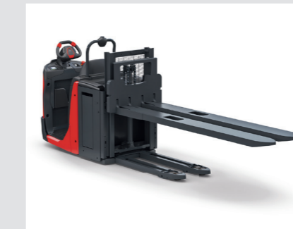
Intuitive Linde Steering Wheel